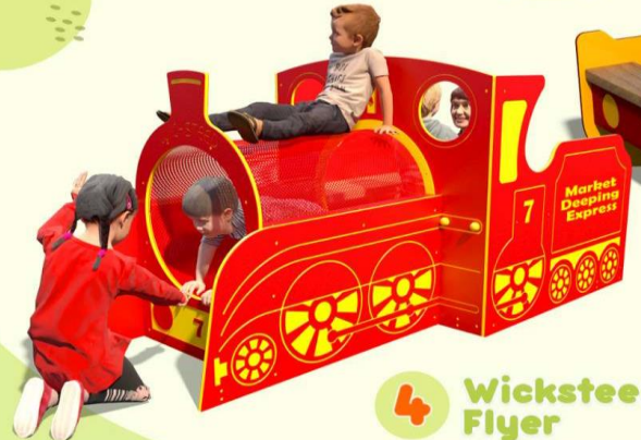
4 Wicksteed Flyer