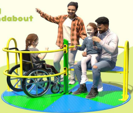
1 Swirl Roundabout