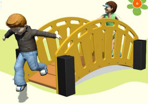
6 Mini Hump Back Bridge