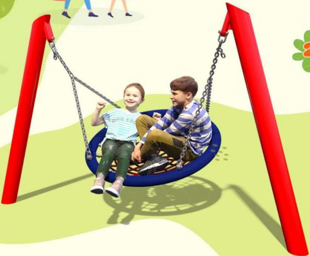
2 Mini Basket Swing