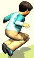
5 Fun Trail Balance Beam